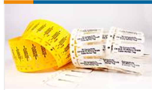
TE Part # A81411-000 HTCM-SCE-TP-1/2-6H-4