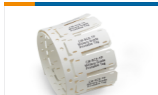
TE Part # EJ0826-000 CM-SCE-TP-1/4-4H-6