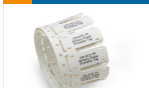
TE Part # EL8600-000 CM-SCE-TP-1/2-6H-5