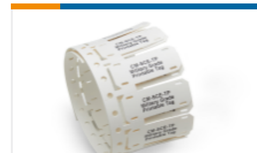
TE Part # EL8598-000 CM-SCE-TP-1/2-6H-3