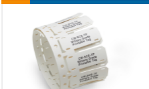
TE Part # EL8599-000 CM-SCE-TP-1/2-6H-1